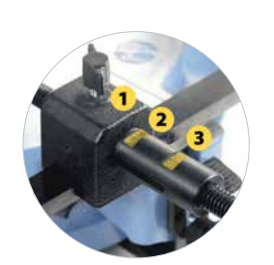
3-stage quick release system