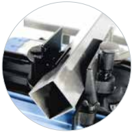
„K“ CLAMPING SET FOR SQUARE TUBES For a safer and more stable sawing process (included)

TWO PATENTED STABILIZERS FOR A BETTER CUTTING SURFACE AND LONG CUTTING LIFE