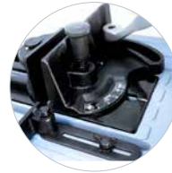
MITER CUTS CAN BE ADJUSTED WITHOUT TOOLS from 90-75-60-45°