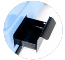
CHIP COLLECTOR For a clean workplace