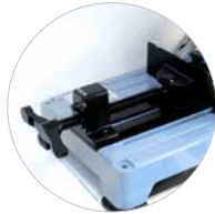
QUICK RELEASE QUICK RELEASE SYSTEM Enables precise and efficient clamping