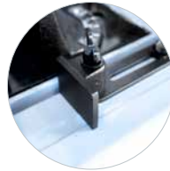
RIP FENCE Increased stability - makes it easier to saw short materials