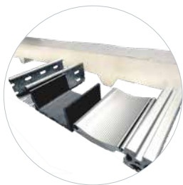
Examples of cuts