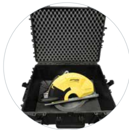
Optional: Transport case with wheels