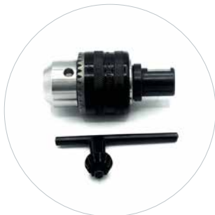
Optional: 0,51" / 13 mm drill chuck & adapter for direct use in the quick-release chuck Art. 490152A