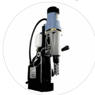
Generous stroke is easily adjustable